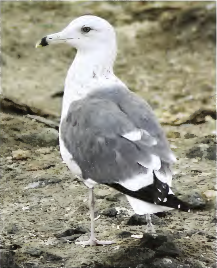
Figure 3. Third calendar-year Steppe Gull Larus (fuscus) barabensis, Massawa, 7 February 2009 Goéland des steppes Larus (fuscus) barabensis de 3e année, Massawa, 7 février 2009

The adult's identification was reviewed by eight experts, the majority of whom concluded that it was a Steppe Gull, and not an Armenian Gull L. (michahellis) armenicus as we originally